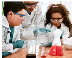
DIY Kits: Do-It-Yourself S.T.E.A.M Kits