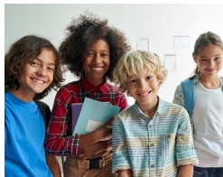
After School Program