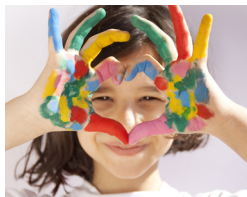
Paint My Bus Tour