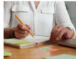
Curriculum Planning & Instructional Design