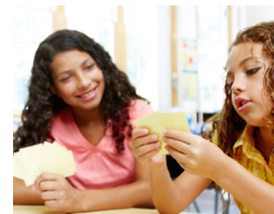
Topics2Discuss Card Game